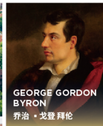
GEORGE GORDON BYRON 乔治 · 戈登 拜伦