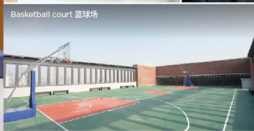
Basketball court 篮球场