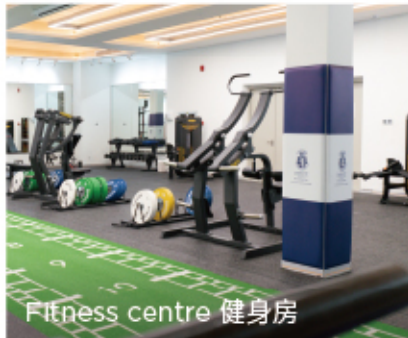
Fitness centre 健身房