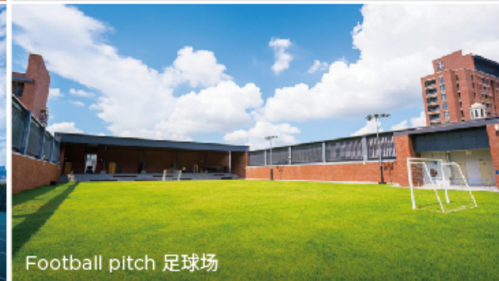
Football pitch 足球场