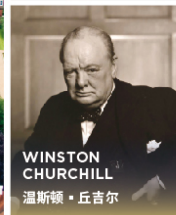
WINSTON CHURCHILL 温斯顿 · 丘吉尔