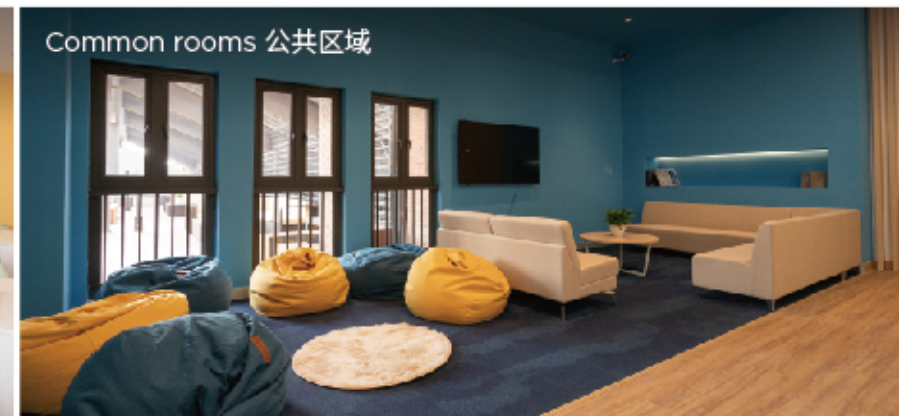
Common rooms 公共区域