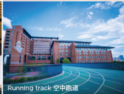
Running track 空中跑道