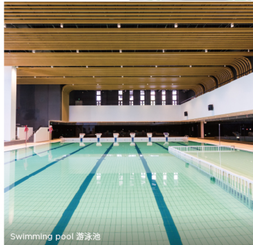
Swimming pool 游泳池