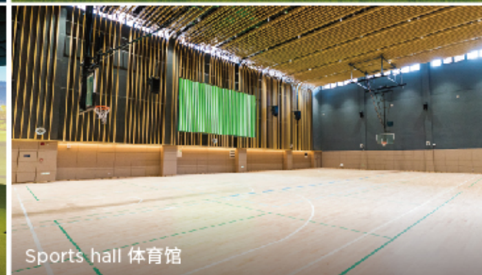
Sports hall 体育馆