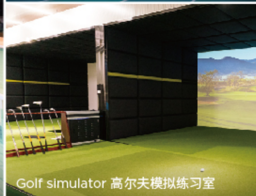
Golf simulator 高尔夫模拟练习室