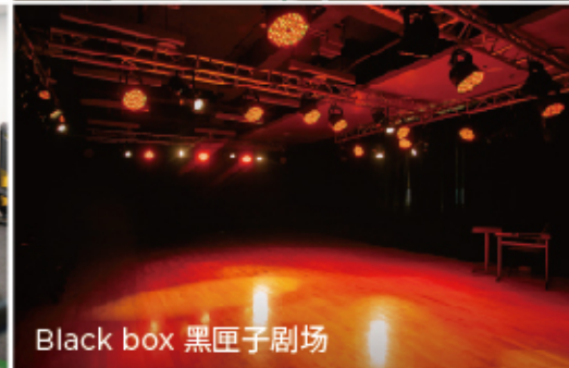
Black box 黑匣子剧场