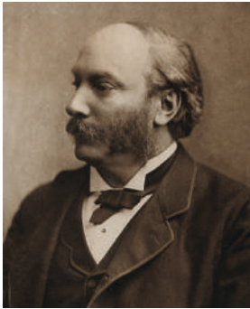
LORD RAYLEIGH 诺贝尔物理学奖 瑞利男爵