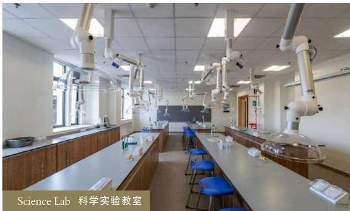
Science Lab 科学实验教室