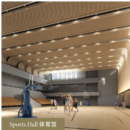
Sports Hall 体育馆