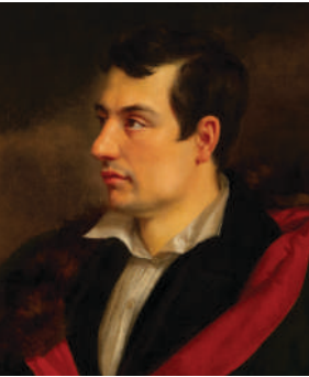
GEORGE GORDON BYRON 乔治·戈登·拜伦