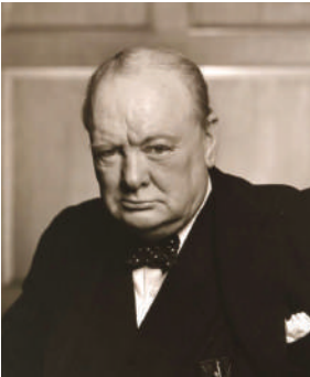
WINSTON CHURCHILL 温斯顿·丘吉尔